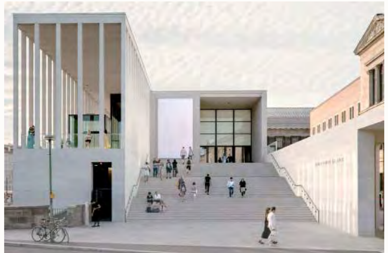
Above James-Simon-Galerie, Museumsinsel, Berlin, Germany, 1999-2019 Left Amorepacific Headquarters, Seoul, South Korea, 2010-17