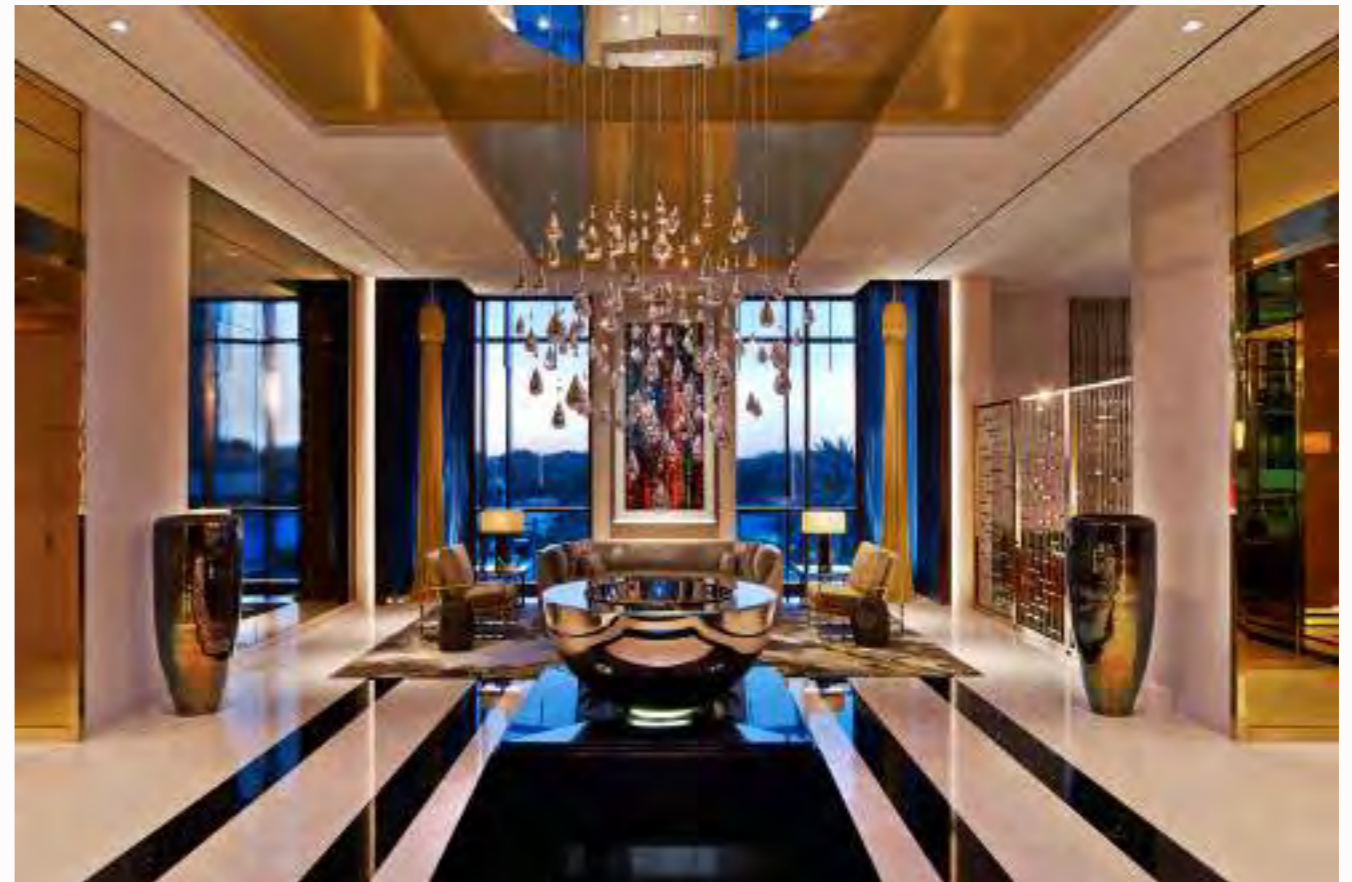
Above Four Seasons Hotel DIFC, Dubai, UAE Left Tihany Studio