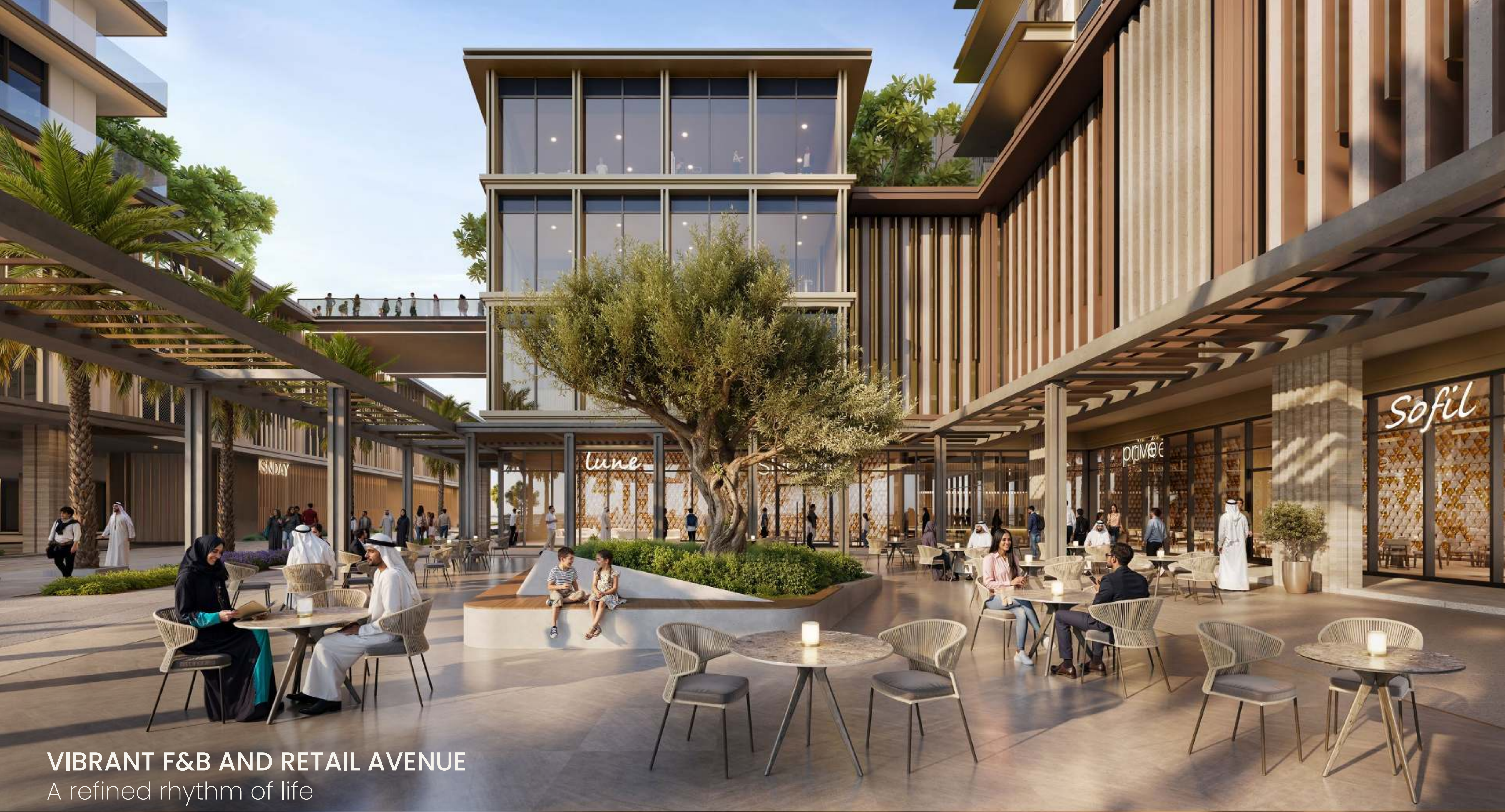
VIBRANT F&B AND RETAIL AVENUE A refined rhythm of life