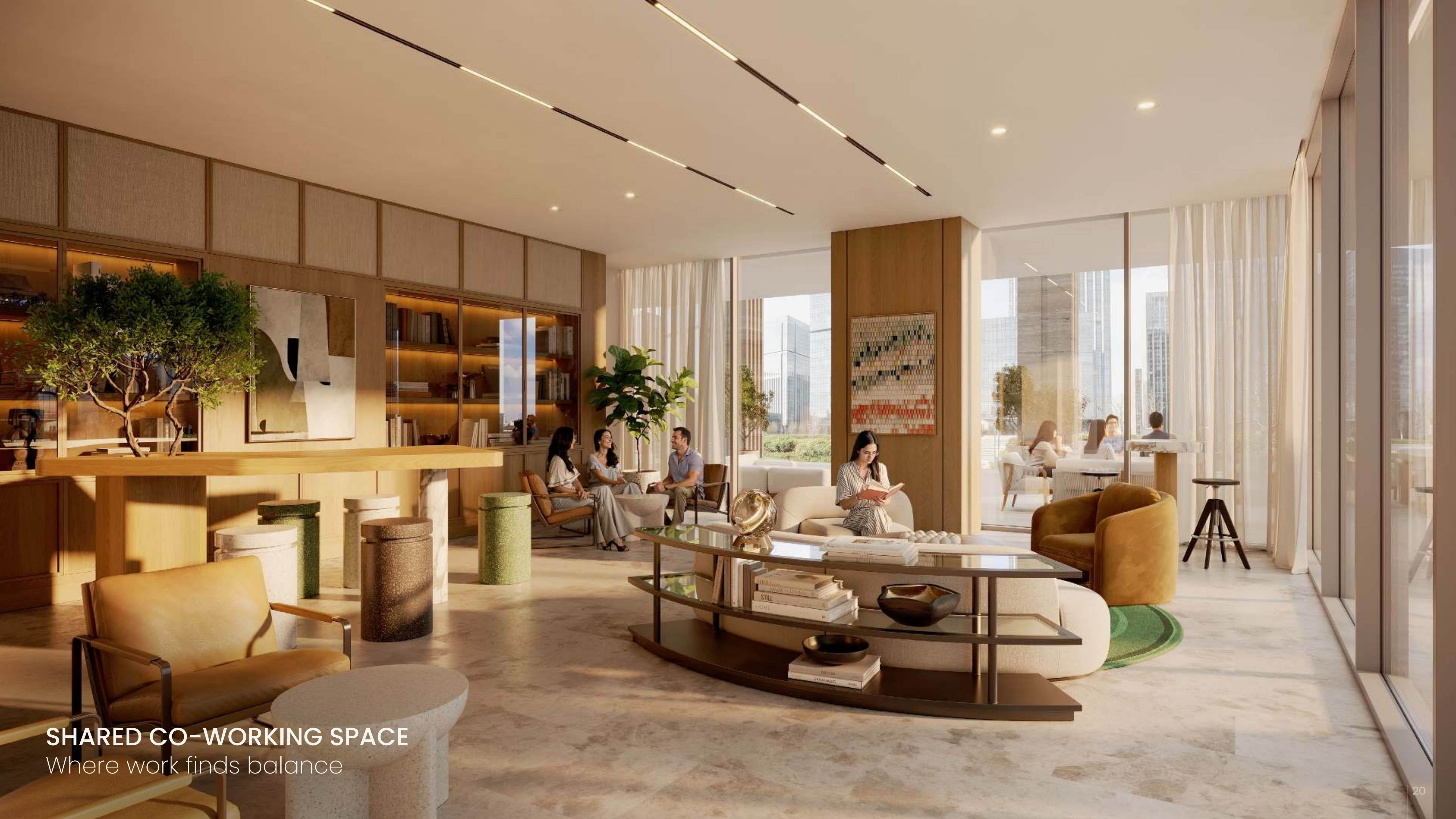
SHARED CO-WORKING SPACE Where work finds balance