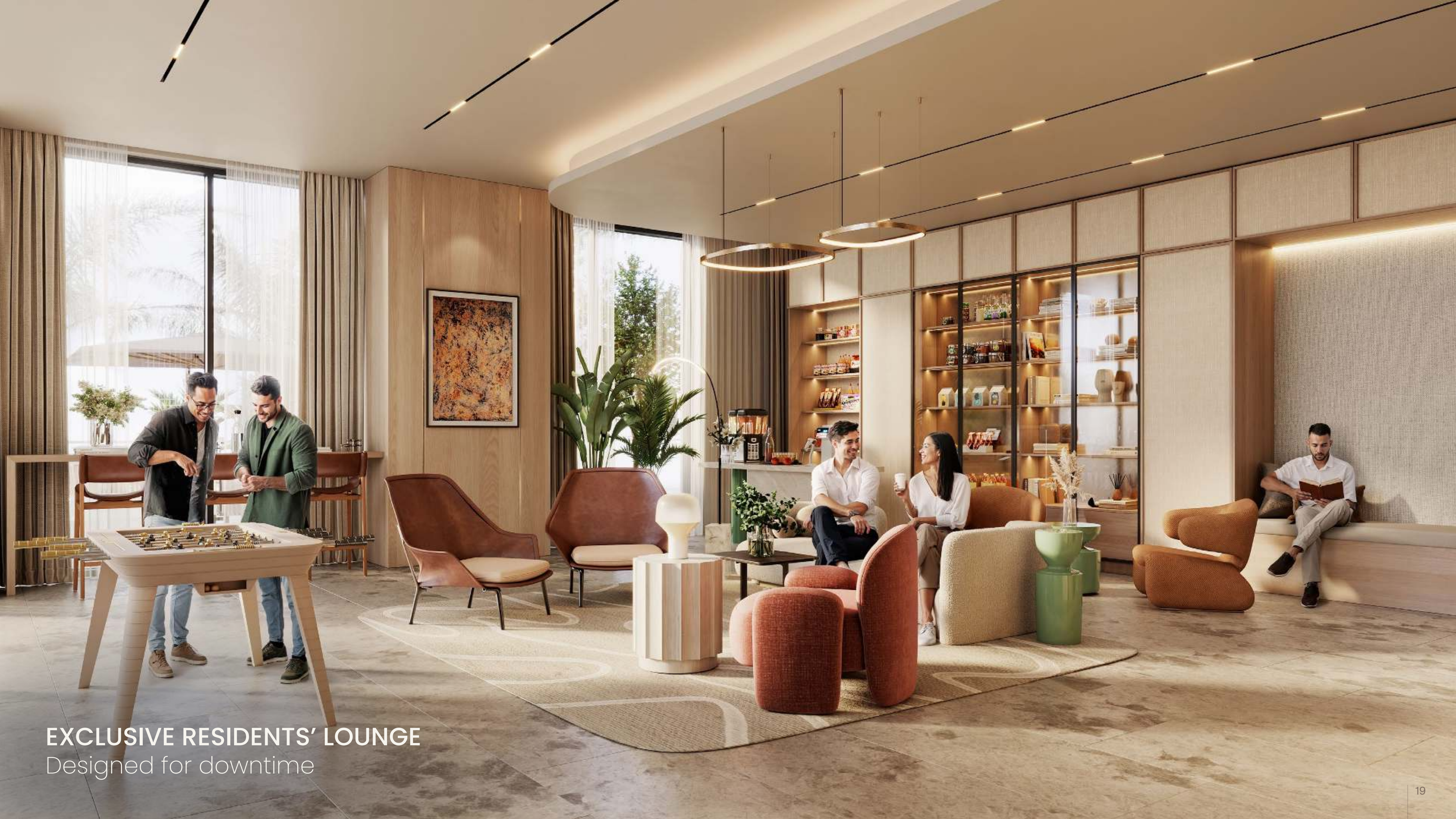
EXCLUSIVE RESIDENTS' LOUNGE Designed for downtime