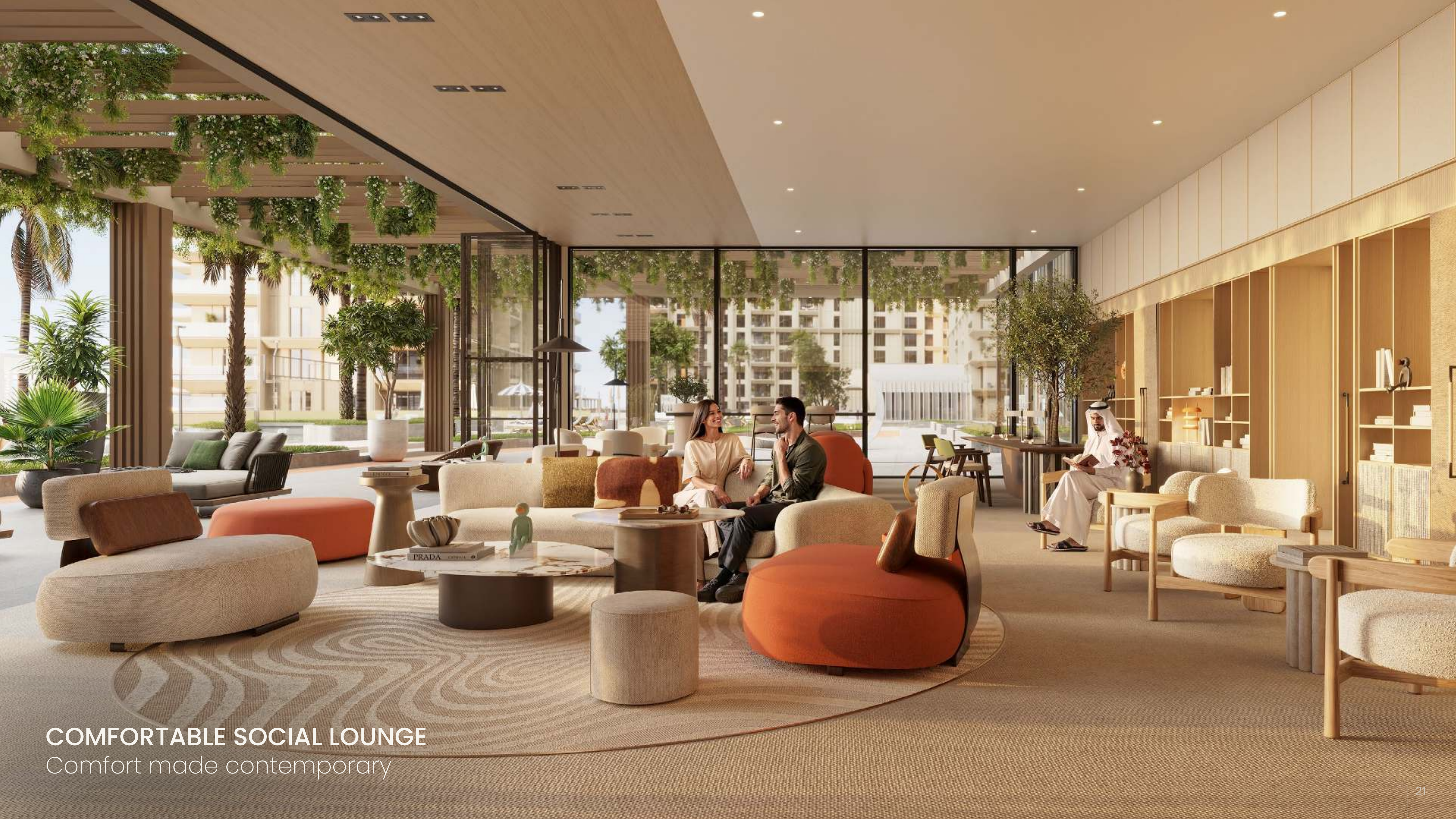
COMFORTABLE SOCIAL LOUNGE Comfort made contemporary