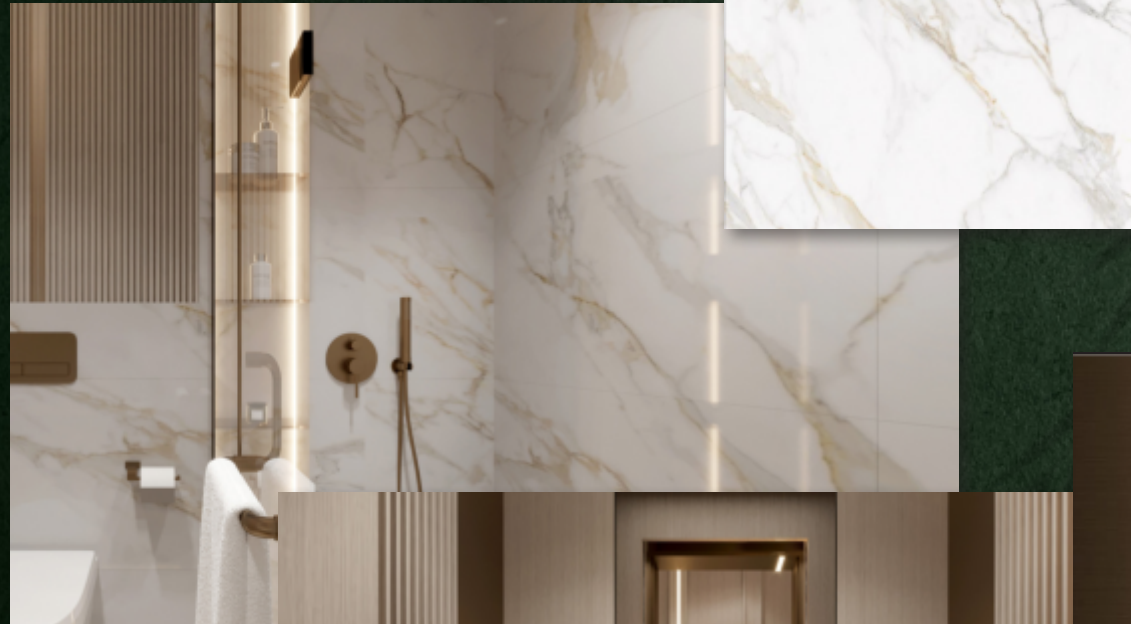
Porcelain bathroom walls & floors