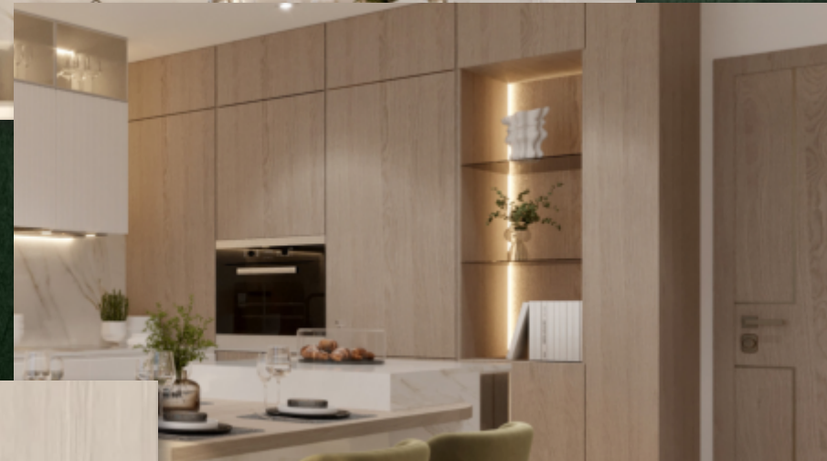
Oak veneer wall panels