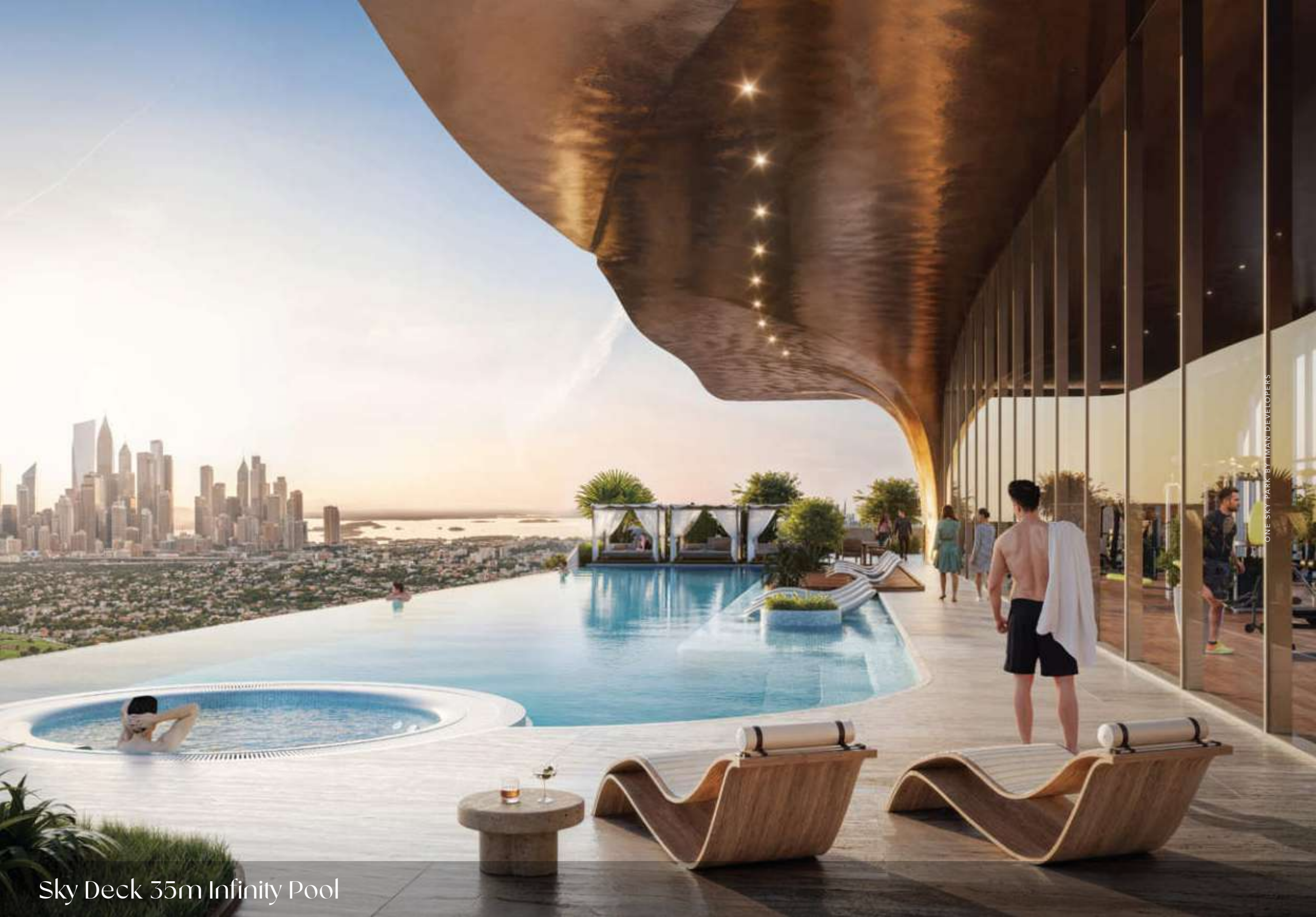
Sky Deck 35m Infinity Pool