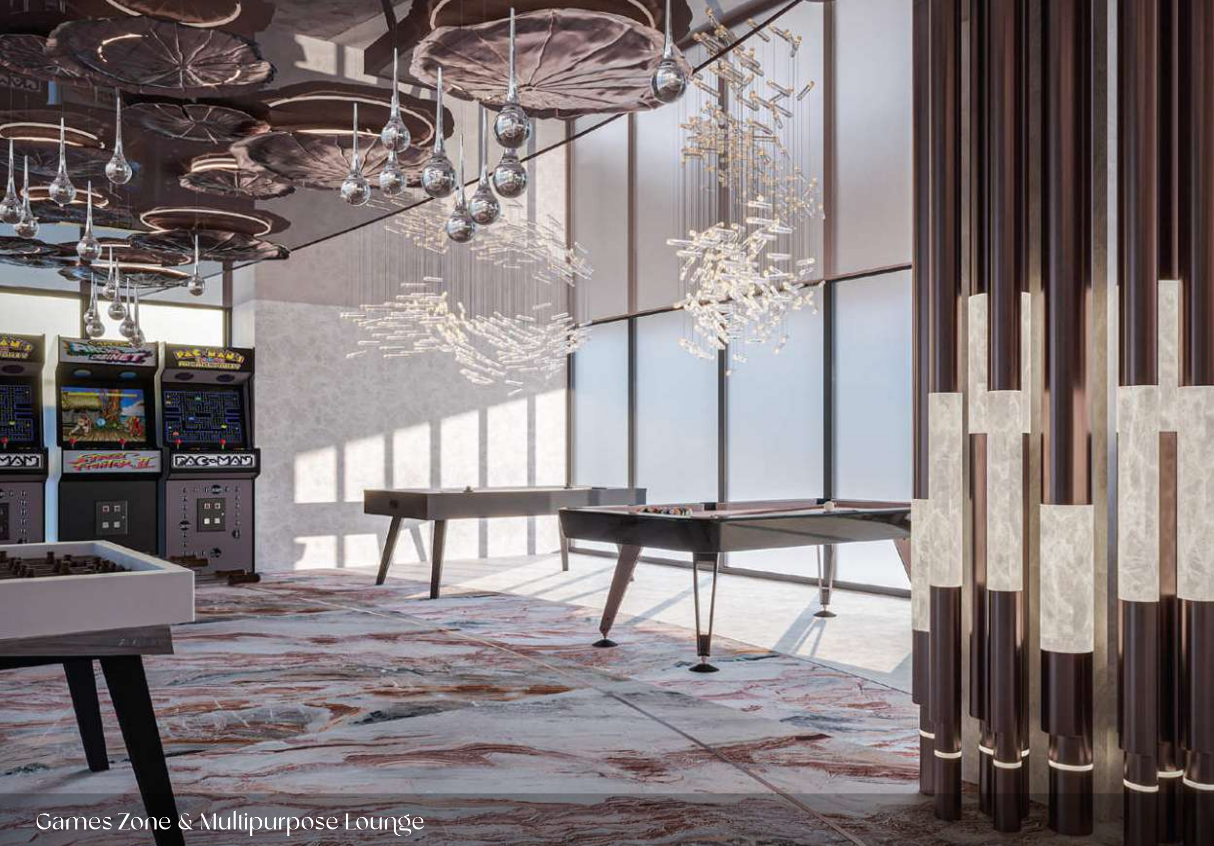
Games Zone & Multipurpose Lounge