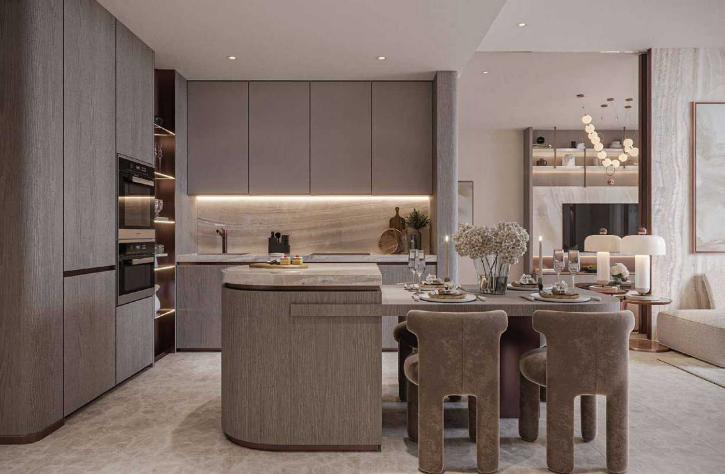
Kitchen & Dining With Branded Appliances