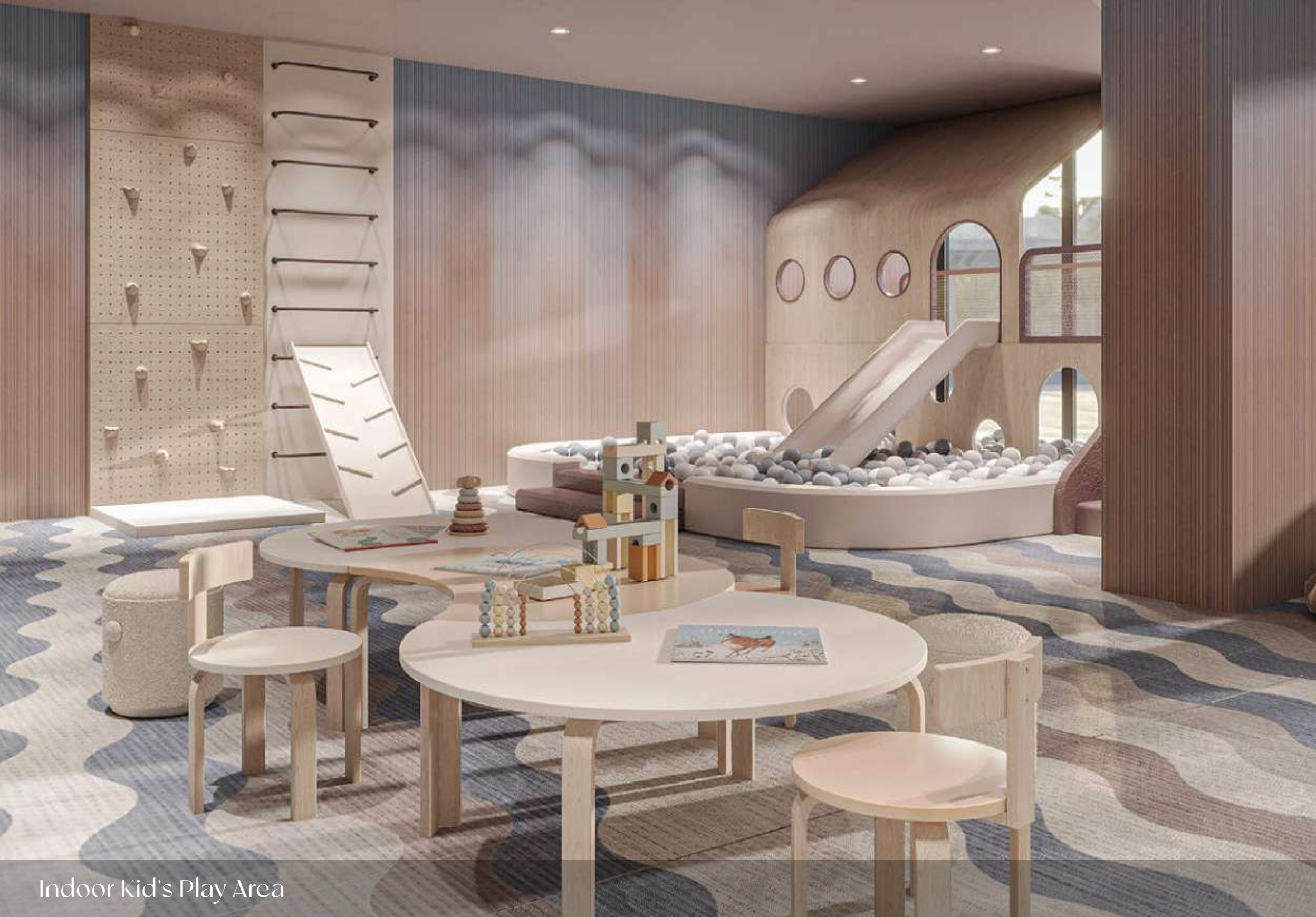
Indoor Kid's Play Area