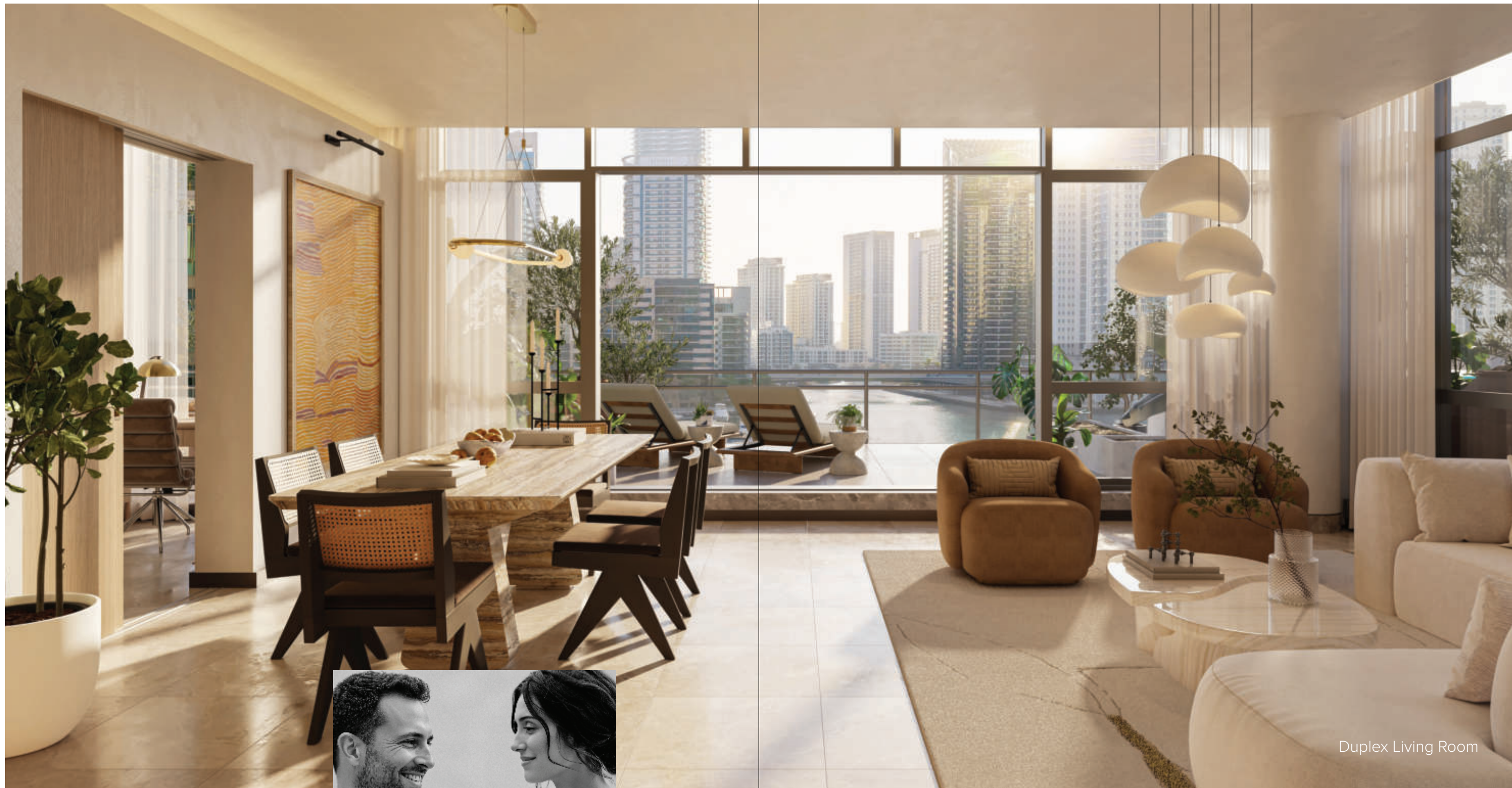
Duplex Living Room