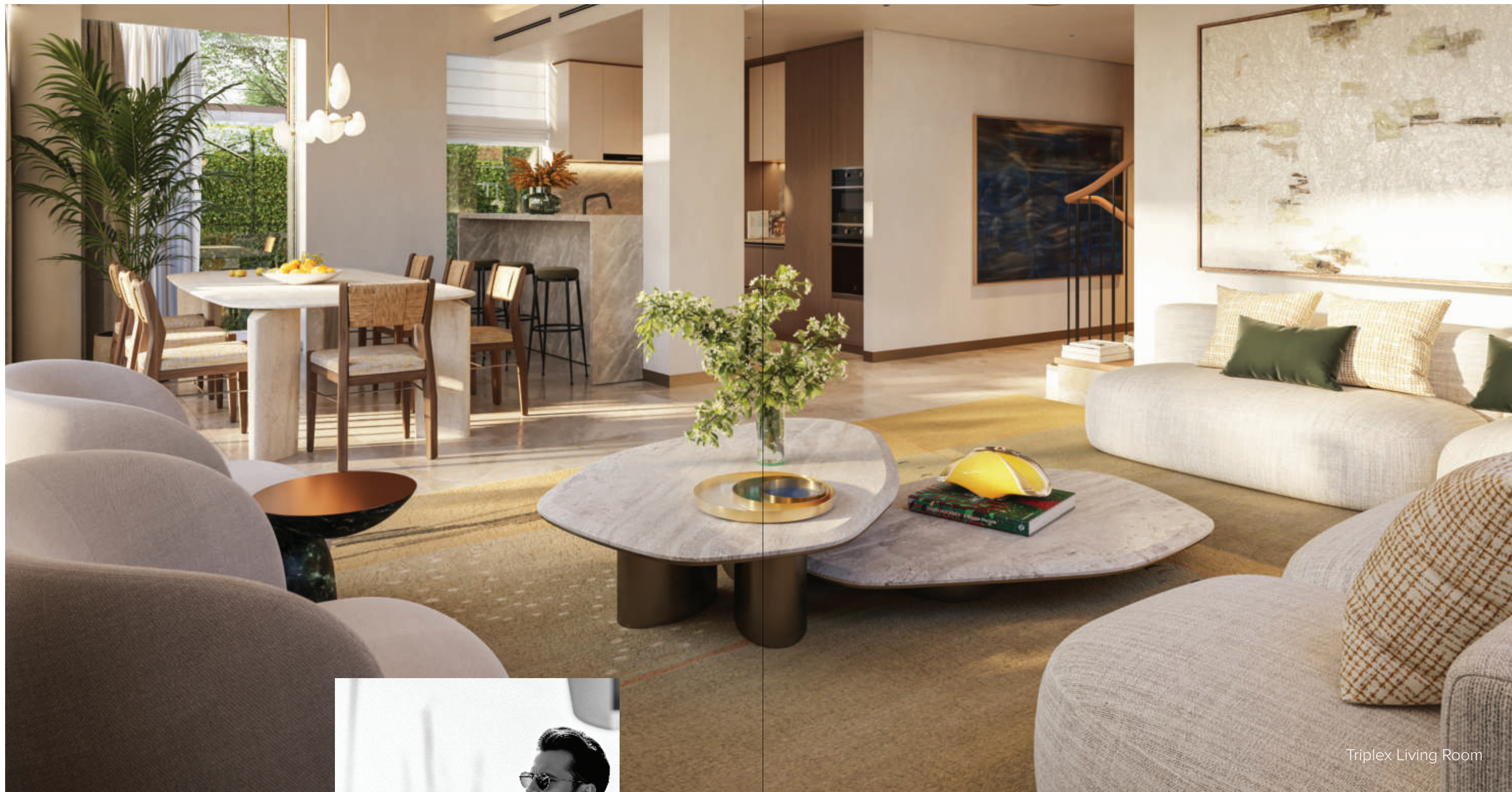
Triplex Living Room